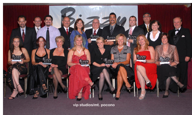
2008 Bizzy Award Recipients